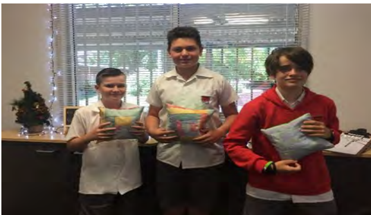
Year 7 Tech student Textile work.