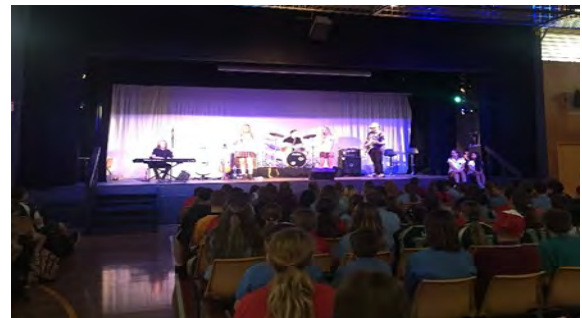
Year 6 orientation concert in the hall.