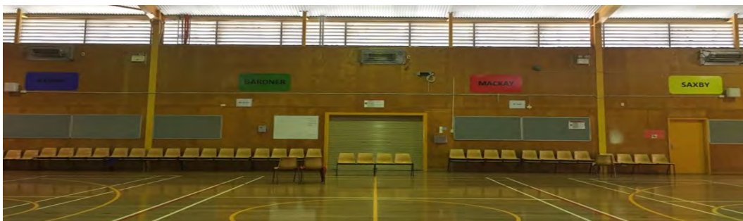
New Sports House signs in the hall.