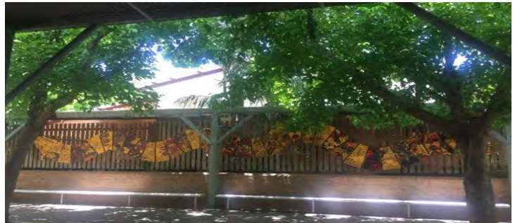
7/8 CAPA class Visual Art & Support Unit Mural.